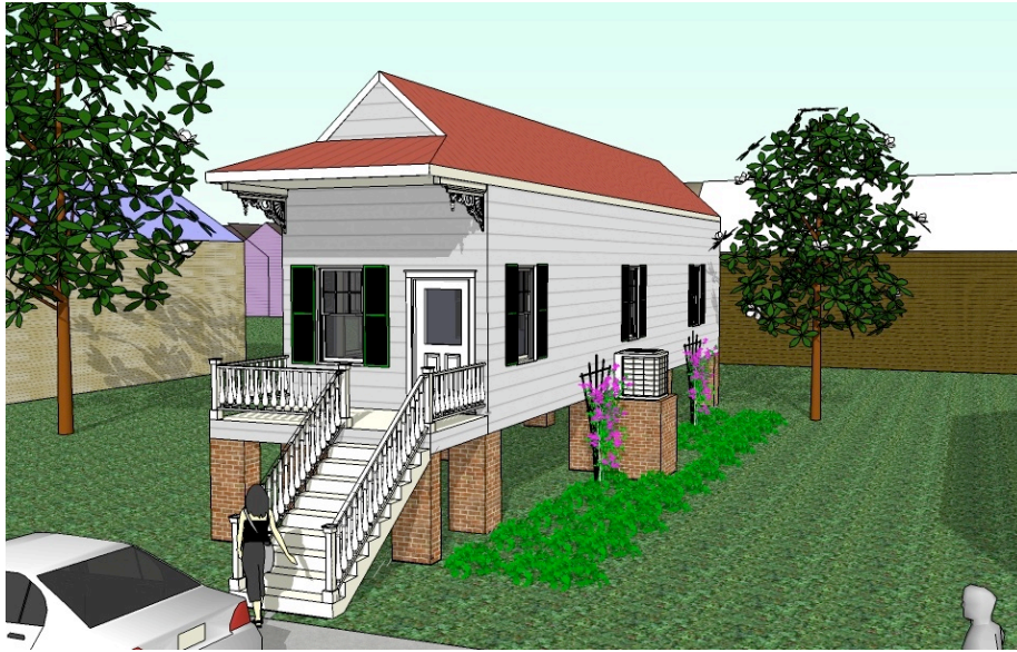
Illustration 2: Sample Efficiency Features on Historic Home